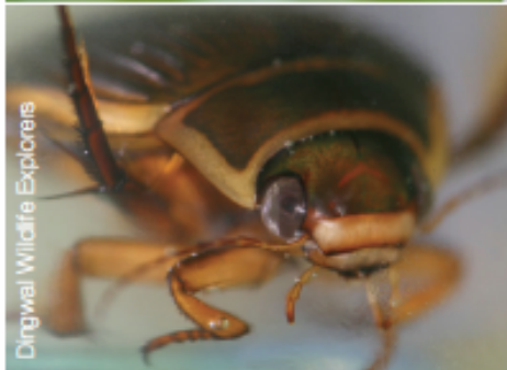
Dingwal Wildlife Explorers