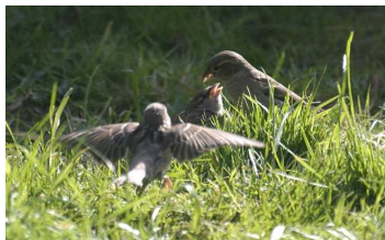
House sparrow / Darin Smith

Sparrows take a wide variety of grain and seeds, as well as bread and other scraps. They may learn to take hanging food but are basically ground-feeders.