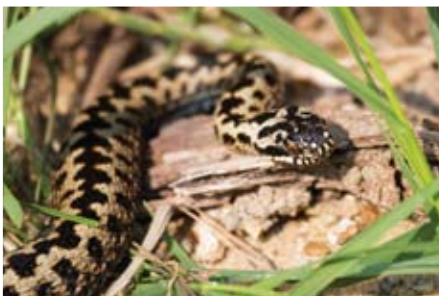
Adder

Sadly adders are still persecuted and both adders and grass snakes are in decline, due to habitat loss and disturbance. However it is illegal, under the Wildlife and Countryside Act to harm any snake.