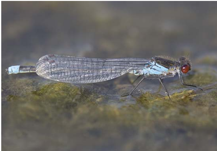
Top: Female emerald damselfly. Left: Male red-eyed damselfly.