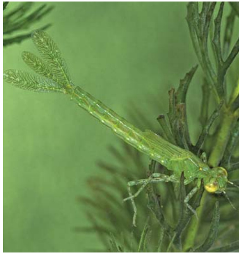
Small red-eyed damselfly larva. Damselfly larvae have three leaf-like appendages at the end of the body.

While in the water, the larvae undergo a series of moults as they grow. Once a larva is ready to become an adult, it leaves the water by crawling up a plant stem or twig and then undergoes its final moult – the skin of the larva splitting to release the winged adult. You may find these discarded skin casts, called 'exuviae', on vegetation by the edge of your pond: clear evidence