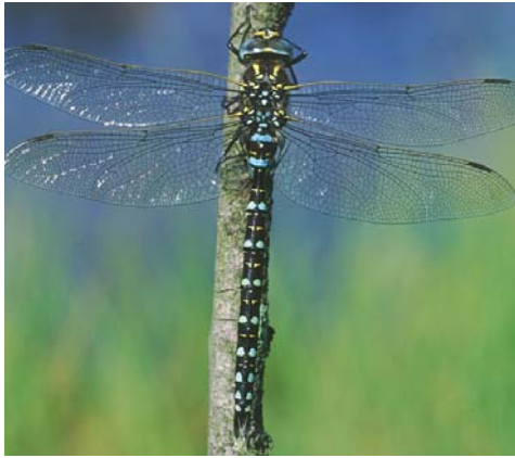
Male common hawker dragonfly.

This is one practical step towards halting the loss of peat bogs, which are home to many of our rarer insect species.