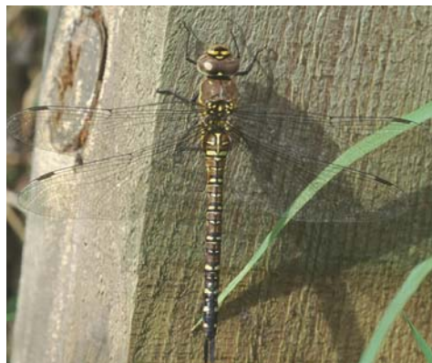
Female migrant hawker dragonfly. David Goddard

The Dragonfly Recording Network (DRN) welcomes all dragonfly sightings, including those from garden ponds. These are very useful in tracking the arrival of new species and the spread of established species. Even the absence of species from gardens can be important as it might be an early sign of changes in their distribution. DRN local recorders would be delighted to hear from you.