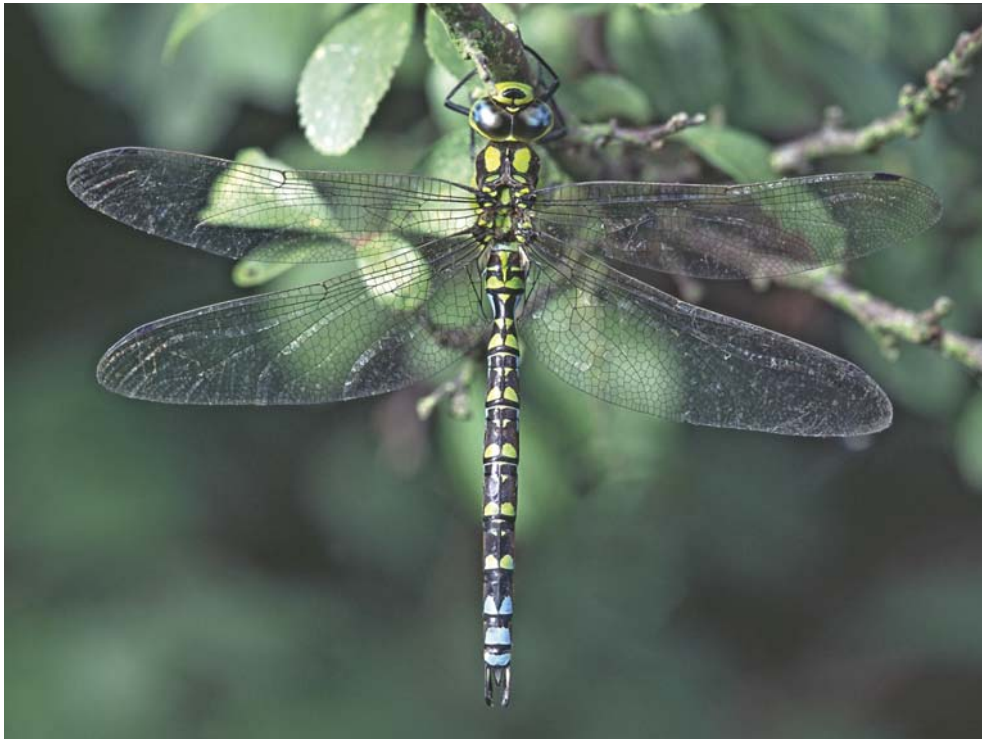
Male southern hawker dragonfly. This species is the one most commonly seen in gardens. Steve Cham