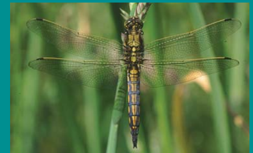
The young male black-tailed skimmer dragonfly above will eventually resemble the mature adult pictured below.