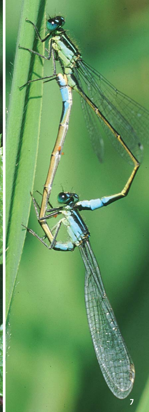
Opposite page left: Male azure damselfly. Opposite page right: Blue-tailed damselflies mating.