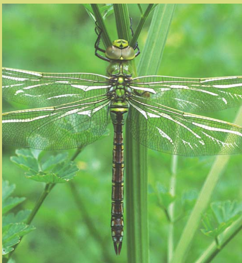
Emperor dragonfly: the shiny wings indicate this is a very young adult.

• Waterbirds. These will prey on emerging adults and can also damage vegetation, either through trampling, grazing or nesting. In