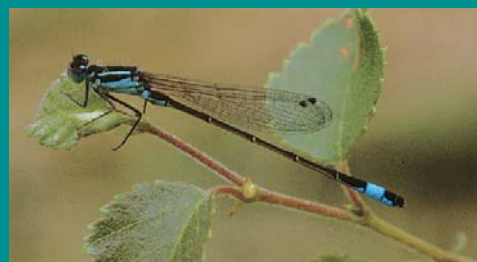
Male blue-tailed damselfly. Tim Beynon

This booklet will tell you about the biology and life-cycles of dragonflies and damselflies, help you to identify some common species, and tell you how you can encourage these insects to visit your garden.