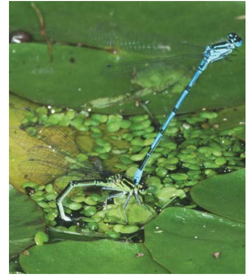
Female azure damselfly laying eggs while in tandem with a male.

After transforming from an underwater nymph to flying adult – but before becoming sexually mature – young adults may spend a week or more away from the water. During this period, the larger dragonfly species can travel several kilometres away to feed on flying insects. This is the reason you