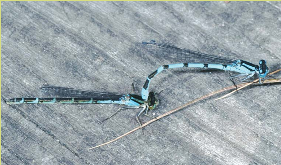
Mating common blue damselflies (female below).