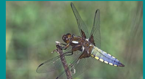
Young male broad-bodied chaser dragonfly developing a blue colouration. Steve Cham