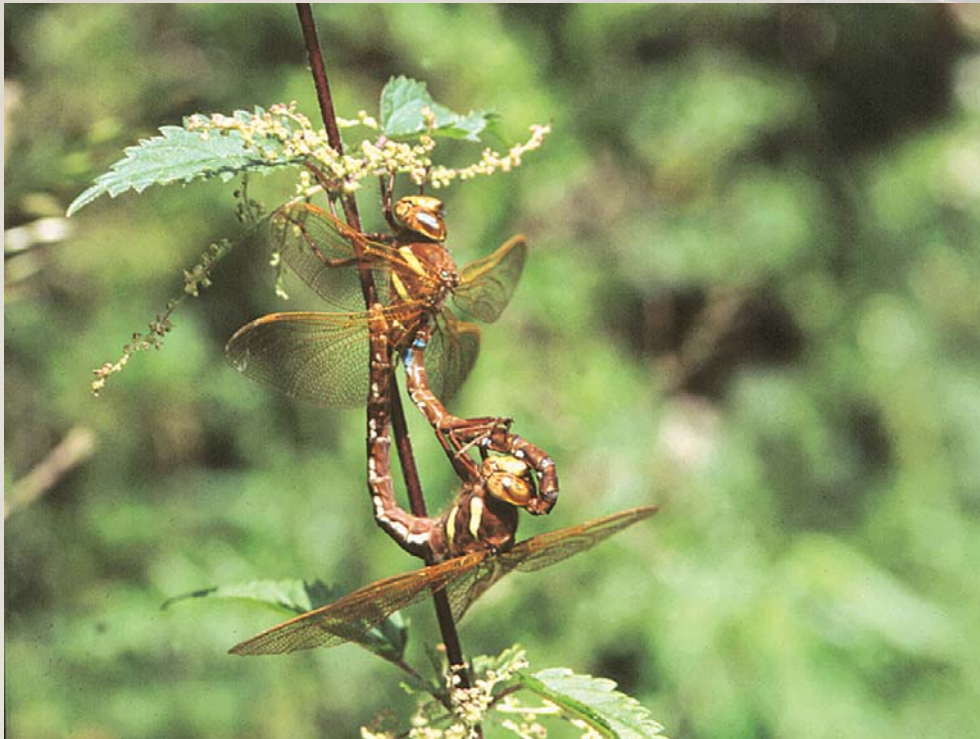
A mating pair of brown hawker dragonflies.

The British Dragonfly Society (BDS) aims to promote and encourage the study and conservation of dragonflies and their habitats in the United Kingdom.