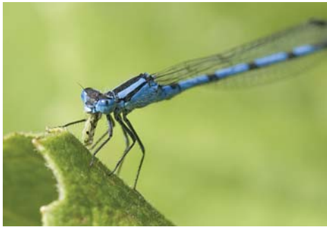
Male common blue damselfly with prey. Steve Cham

As adults, dragonflies and damselflies are big eaters and may consume 20 per cent of their bodyweight in food each day. They eat other flying insects, particularly flies, midges and mosquitoes – making them very useful creatures to have around the garden! The larger species will also take butterflies, moths and even smaller dragonflies or damselflies.