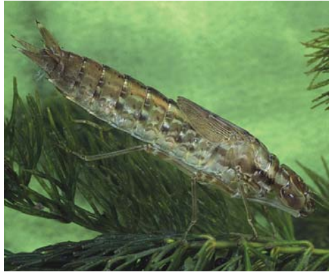
Emperor dragonfly larva. The spines at the end of the body are typical of dragonfly larvae. Steve Cham

Most of a dragonfly's or damselfly's life – perhaps as much as 95 per cent of it – is spent in the water. The eggs, which are usually laid underwater, develop into larvae, free moving, water-dwelling nymphs, from which the flying adult insects eventually emerge. The whole process may be completed within six