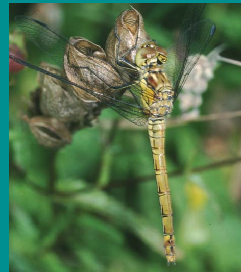
Female common darter dragonfly with yellowish body.

Some damselflies, like the blue-tailed species, undergo a gradual colour change as they mature. The females of these species have several different colour forms, with some changing from violet to blue or rich brown, and others from salmon-pink to yellowish-brown. Some of the larger dragonflies also change colour as they age. For example, the common darter dragonfly goes from yellow brown to reddish brown, and the black-tailed skimmer dragonfly goes from yellow-brown to blue-grey. Sometimes, older females may start to develop the coloration of the males.