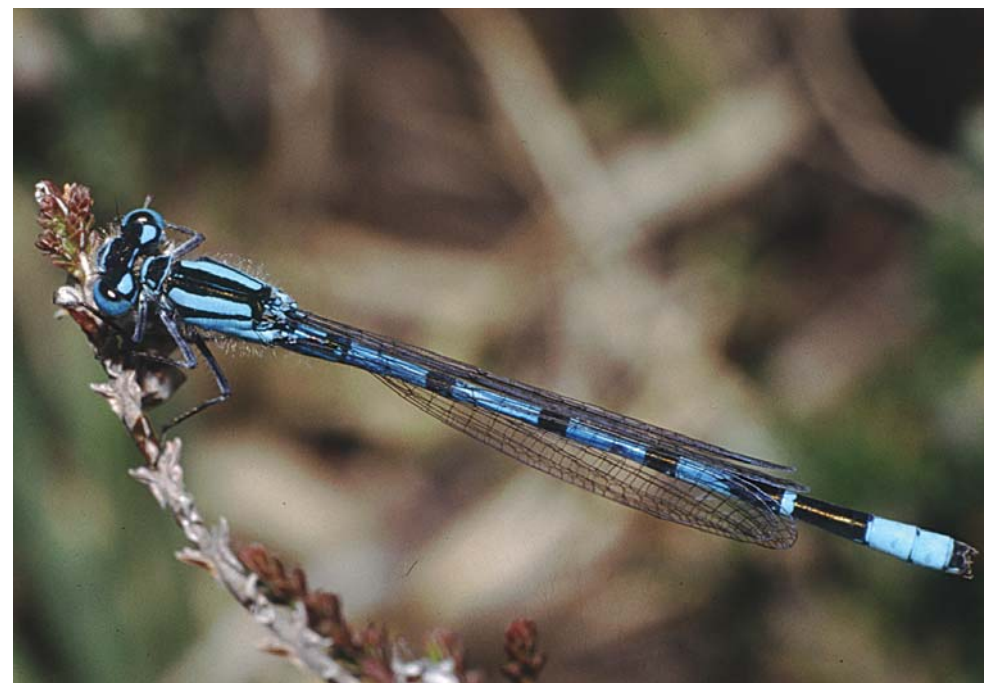
Male common blue damselfly. Most damselflies hold their wings against their bodies when at rest. BDS

Despite their name – and some legends – dragonflies are quite incapable of hurting humans. Neither do they deserve their nickname ‘horse stinger’. Some people have seen grazing horses apparently shying away from hawk dragonflies and assumed the dragonflies have stung them – in reality the dragonflies are hunting biting flies that are bothering the horses.