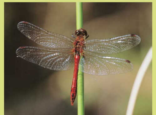
Right: Male ruddy darter dragonfly.