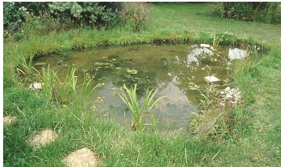
Even small garden ponds can be visited by several dragonfly species. Ian Johnson

addition, excessive droppings from aquatic birds can add nutrients to the water, encouraging the growth of unwanted algae and/or bacteria which use up oxygen in the water.