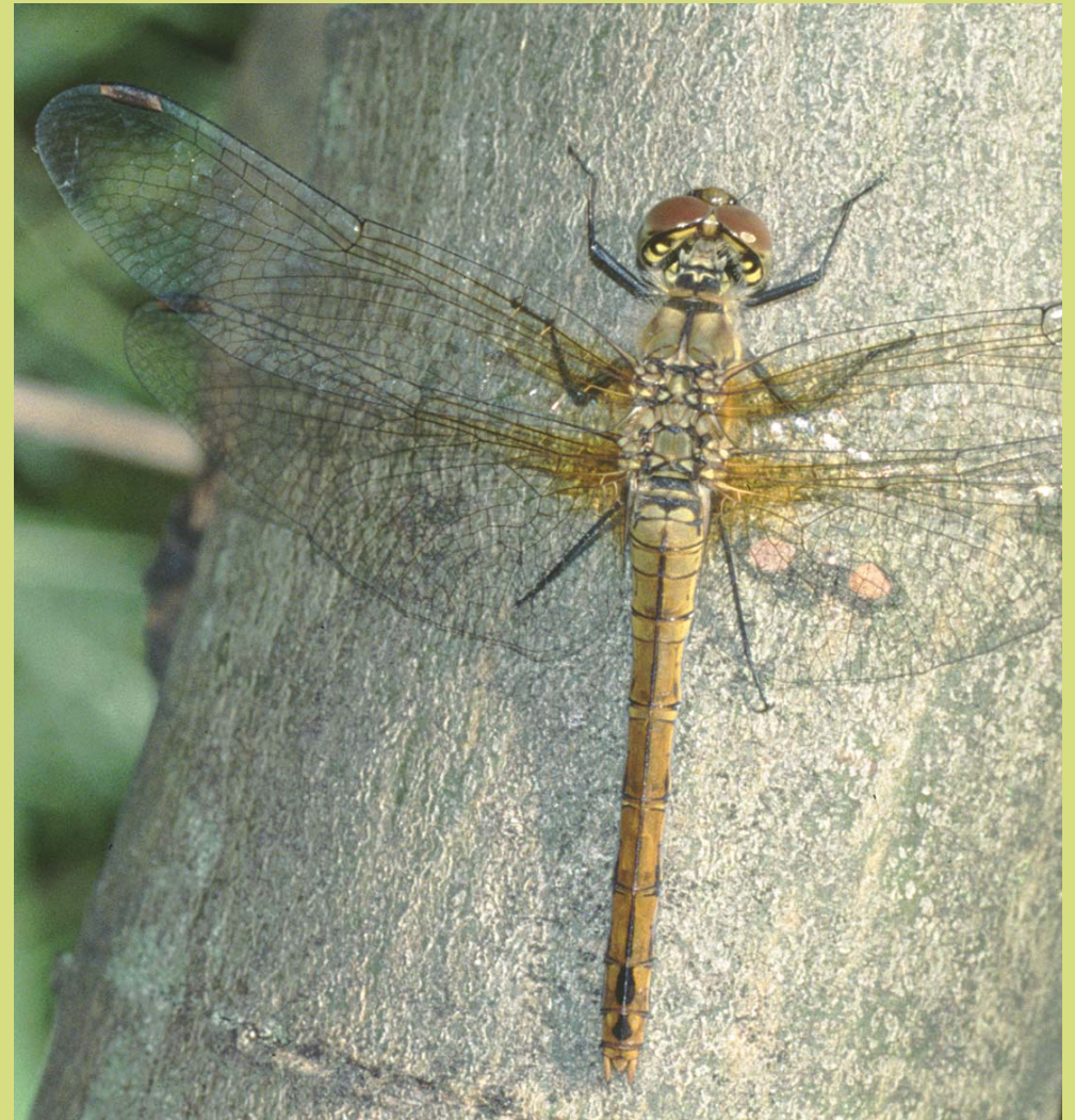
Above: Female ruddy darter dragonfly.