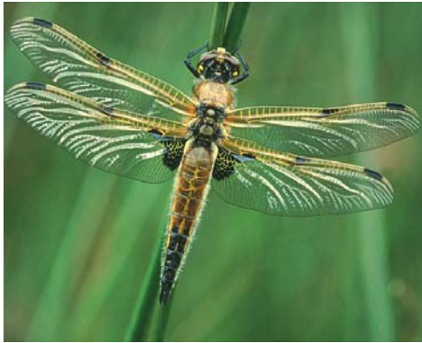
The four-spotted chaser dragonfly. Dragonflies keep their wings open when at rest.