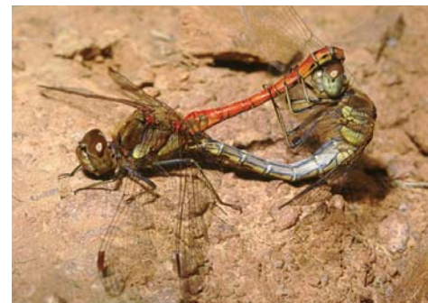
Common darter dragonflies mating.

Apart from their beauty and importance to wetland ecosystems, dragonflies and damselflies are also very valuable indicators of water