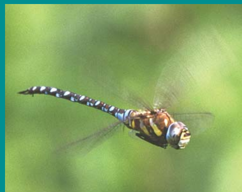
Top: Male brown hawker dragonfly. Bottom: Male migrant hawker dragonfly.

Modern dragonflies are tiny by comparison, but are still large and spectacular enough to capture the attention of anyone walking along a river bank or enjoying a sunny afternoon by the garden pond.