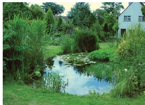
Well-vegetated ponds are ideal for dragonflies, especially those with nearby cover to provide shelter from high winds. Dr Steve Head

Although garden ponds cannot compensate for the loss of wetland habitats, they are still of great value for