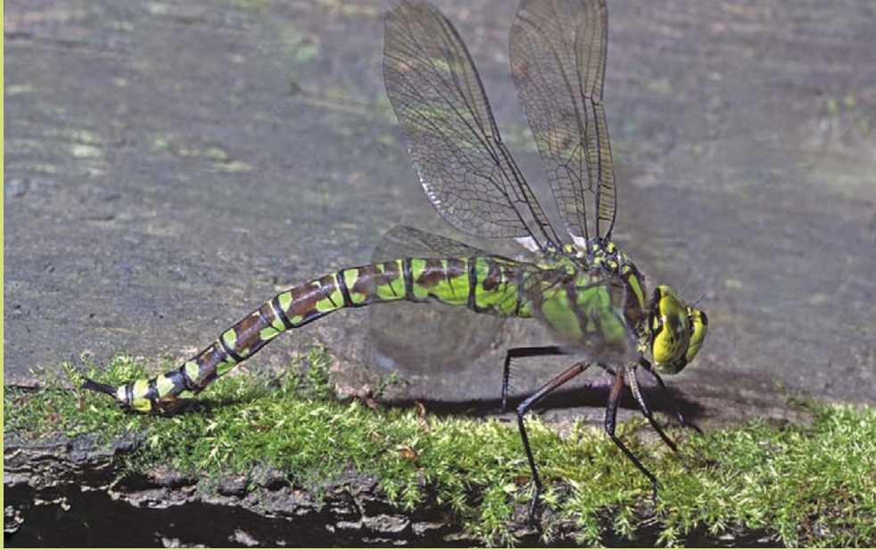
Female southern hawker dragonfly laying eggs in decaying wood. Steve Cham

from accidents or predation. Dragonflies and damselflies are unable to hunt in poor weather and large numbers simply starve at these times.