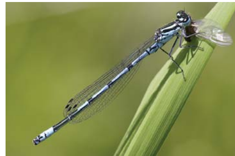
Male azure damselfly with prey. Steve Cham

Dragonfly and damselfly larvae will eat almost any creature that is smaller than they are. Prey may include bloodworms, snails, water fleas, tadpoles and the larvae of mosquitoes or other aquatic insects. The larvae of larger dragonflies may also catch and eat small fish.