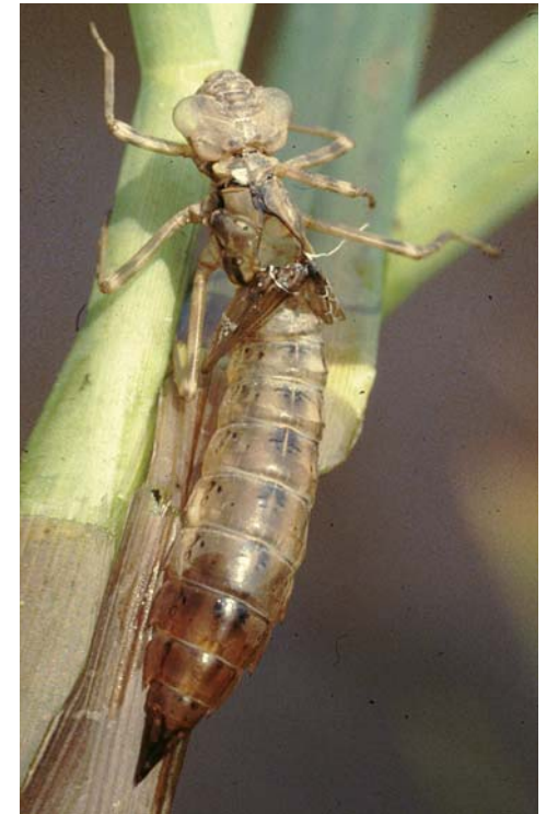
The larval skin of a hawker dragonfly.

The plants around your pond are equally important. Areas of short and long grass close to the pond will be used as mating and feeding grounds, while nearby shrubs and trees are