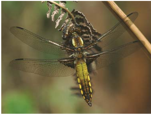
Left: Mature male broad-bodied chaser dragonfly with powdery blue colouration. BDS/J. Stevens Right: Female of the same species with yellow-brown colouration. BDS/I. Hulme