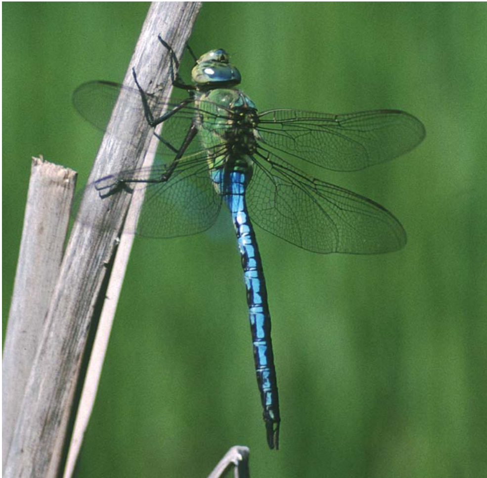
Male emperor dragonfly.