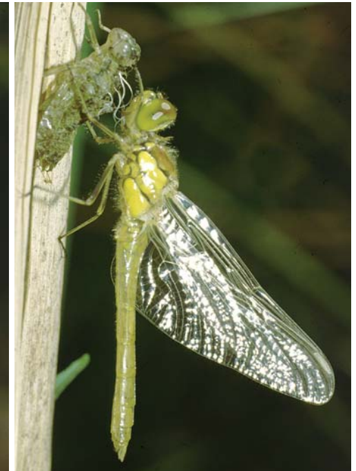
A common darter dragonfly emerges from its larval skin. BDS