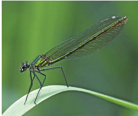
Male (top) and female (above) banded demoiselles damselflies: note the dark patch on the male's wings. Below: Male large red damselfly.