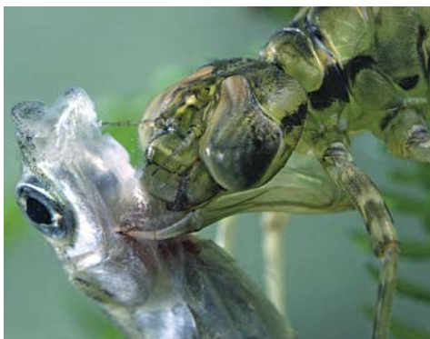
A southern hawker dragonfly nymph uses its 'mask' to catch a stickleback. Steve Cham

Adults use their impressive eyesight to detect prey. In flight, they hold their bristly legs in a basket shape to scoop up and then firmly grasp their targets before eating their catch, often in mid-air.