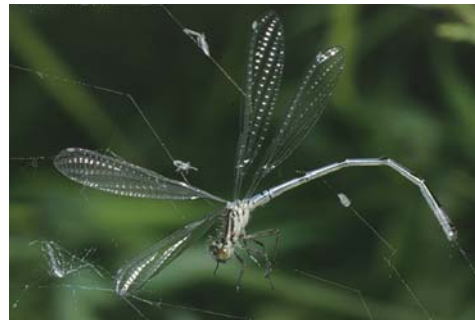
A young azure damselfly in a spider's web.

Among the species that catch and eat adult dragonflies and damselflies are birds (such as wagtails and hobbies), spiders, frogs, and larger species of dragonflies. However, dragonflies and damselflies are not helpless; their excellent eyesight and flying skills help protect them from capture, while the warning colours of some species – black and yellow, or black and red – deter some bird predators.