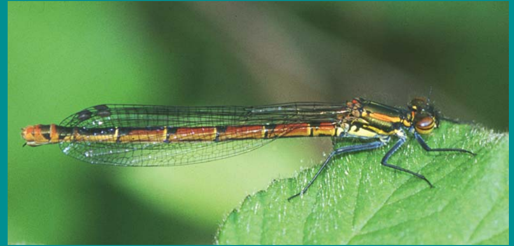
Above: Female large red damselfly. Bottom: Male emerald damselfly. Unusually, this species holds its wings half open when at rest.

Dragonflies and damselflies are creatures of the sun. In England, they may be seen on any warm day between April and October, but most commonly at the height of summer. The distinctive colours of the adults make it relatively easy to tell one species from another and they are quite riveting to watch. (One point of caution – the colours of dragonflies and damselflies change as they mature, see Colour changes, page 18.)