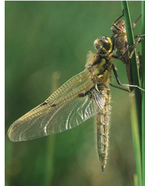
Newly emerged four-spotted chaser dragonfly next to its larval skin.

might see dragonflies in your garden even if you don't have a pond nearby.