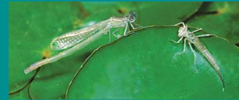
A young large red damselfly yet to develop its adult colours.

When dragonflies and damselflies first emerge from the water, most have very muted colours. It can take several days before they gain their brilliant adult appearance. Common blue damselflies, for example, are often a pale pinkish-brown rather than sky-blue when they first appear as adults.