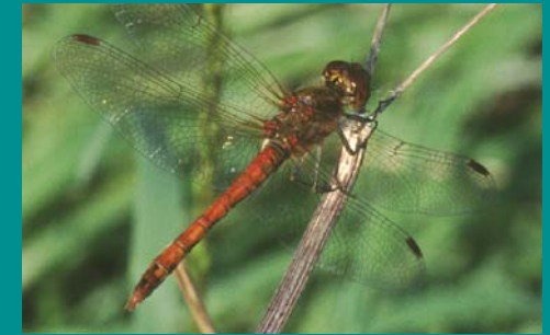
Male common darter dragonfly with orange-red body.