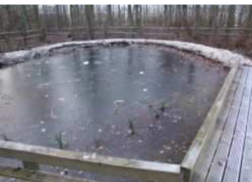
Frozen pond at Seven Sisters