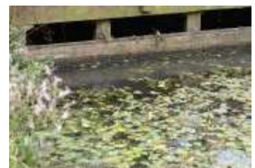
Leaves on pond

Wildlife Implications: If you net your pond amphibians can easily get caught up in the netting. Ensure you leave at least a 2inch gap between the ground and netting for animals to get in and out of the pond.