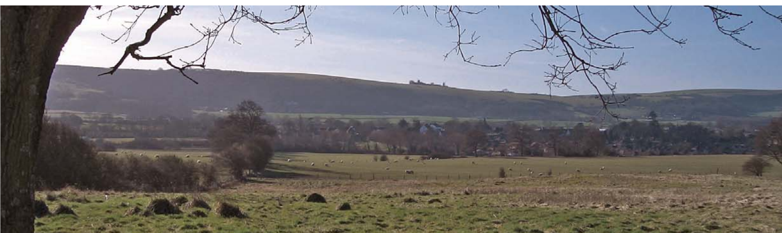
view of the Downs from near Lodge Hill, Ditchling