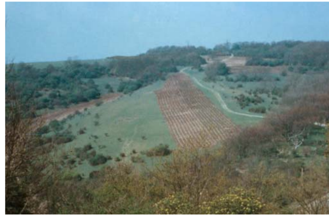
The ploughing of chalk grassland at Offham Down SSSI, near Lewes, just before the 1997 General Election raised the Campaign's profile