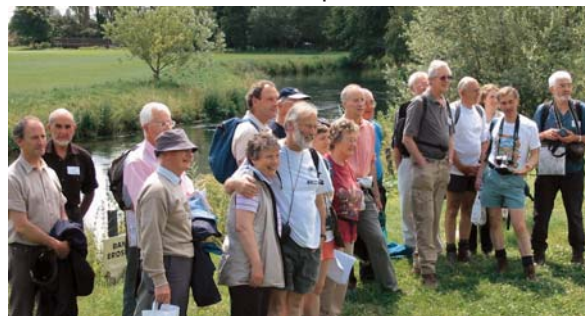
Campaign for National Parks' Walk near Winchester with Sir Chris Bonington in 2002

With this news, the Campaign realised it had to take its work to a new level. Although it had won a great victory in securing the start of the designation process, all could still be lost if the National Park did not cover a wide enough area. Indeed there was a risk that an Inspector might not recommend there be a