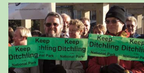
Ditchling campaigners outside re-opened inquiry in Worthing in February 2008

10 December 2009 - Government announces size and make up of new National Park Authority.