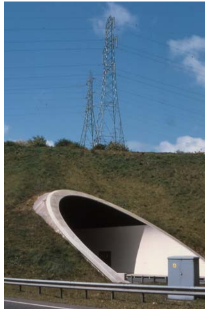
Pylons over Southwick Hill - could offshore wind farms lead to the undergrounding of these lines?

Climate change is going to be a big issue for the Downs on a number of fronts. With the fragmentation of many habitats, particularly the internationally rare ancient chalk grassland, many wildlife species could be at risk as temperatures rise. Yet by working with partners such as farmers and landowners, the National Park Authority could start reconnecting these habitats so that species are able to move to cooler areas. That way, while things will